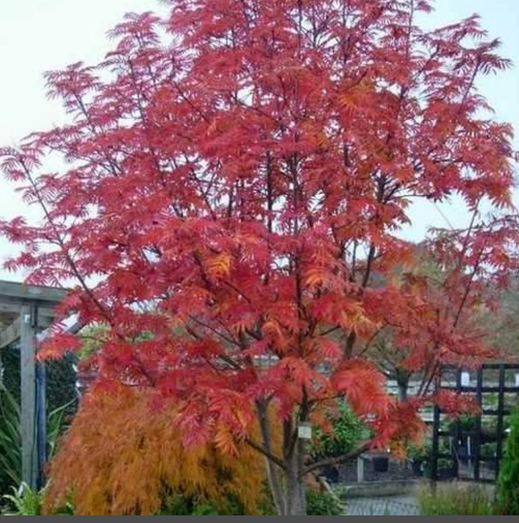
Sorbus commixta 'Olympic Flame'

A real eye-catcher in Autumn Turning yellow to red or purple