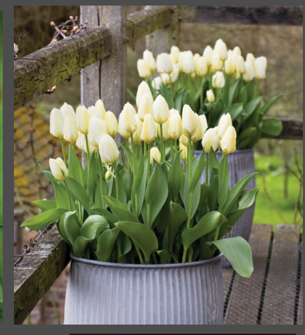
Hyacinthoides nonscripta (Native) March Fritillaria meliagris - March/April Tulip Purissima - March/April Narcissus 'Thalia' - March/April Chionodoxa lucilae - March Anemone leveillei - May