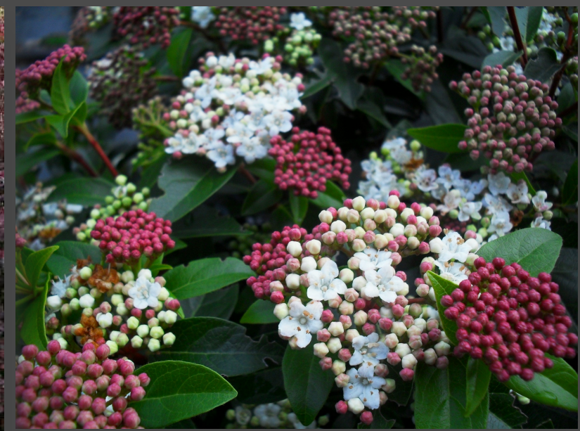
Viburnum tinus AVAILABLE 'French white' – reliable evergreen, scented, flowers Feb-March.