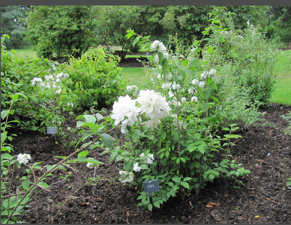
Philadelphus virginalis Enchantment

You have introduced this one to me so I don't know much about it but if we cannot source it there is always P. Coronarius or P. Belle Etoile Flowering: June/July AVAILABLE