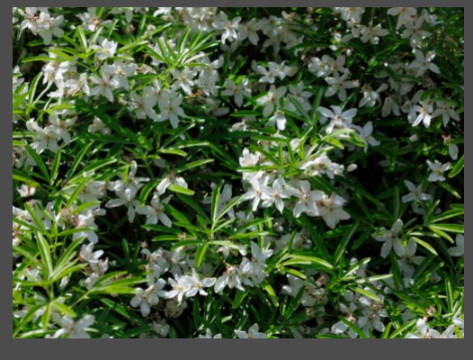
Choisya x dewitteana Aztec Pearl

Compact fragrant evergreen. The most attractive Mexican orange blossom