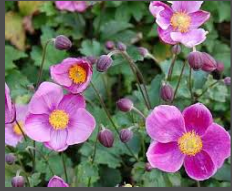
Anemone hupehensis praecox Anemone Honerine Jobert Reliable late summer display Flowering: August-September AVAILABLE