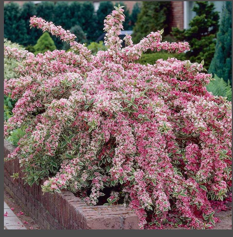
Wiegela Florida variegata

Wonderful pale pink flowers May/June Needs a good prune back after flowering AVAILABLE