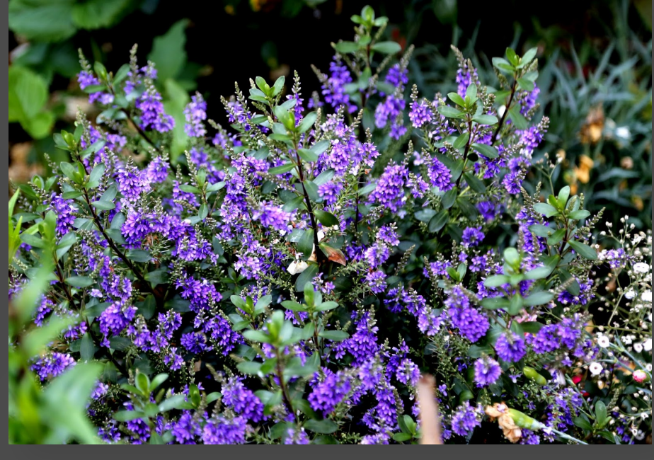
Hebe "Purple Pixie"