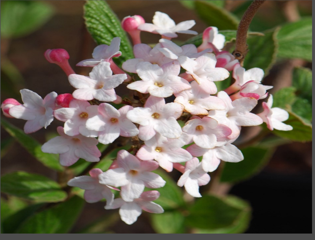
Viburnum x juddii One I have discovered this year with the most fabulous scent in Autumn and into Winter NOT YET AVAILABLE