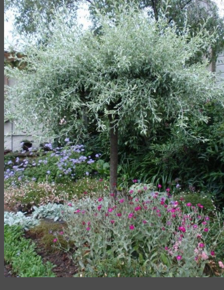
Pyrus salicifolia pendula

Lovely weeping pear is a wonderful foil for blue/purple planting such as your lavender Very popular with bees. Blossom April/May