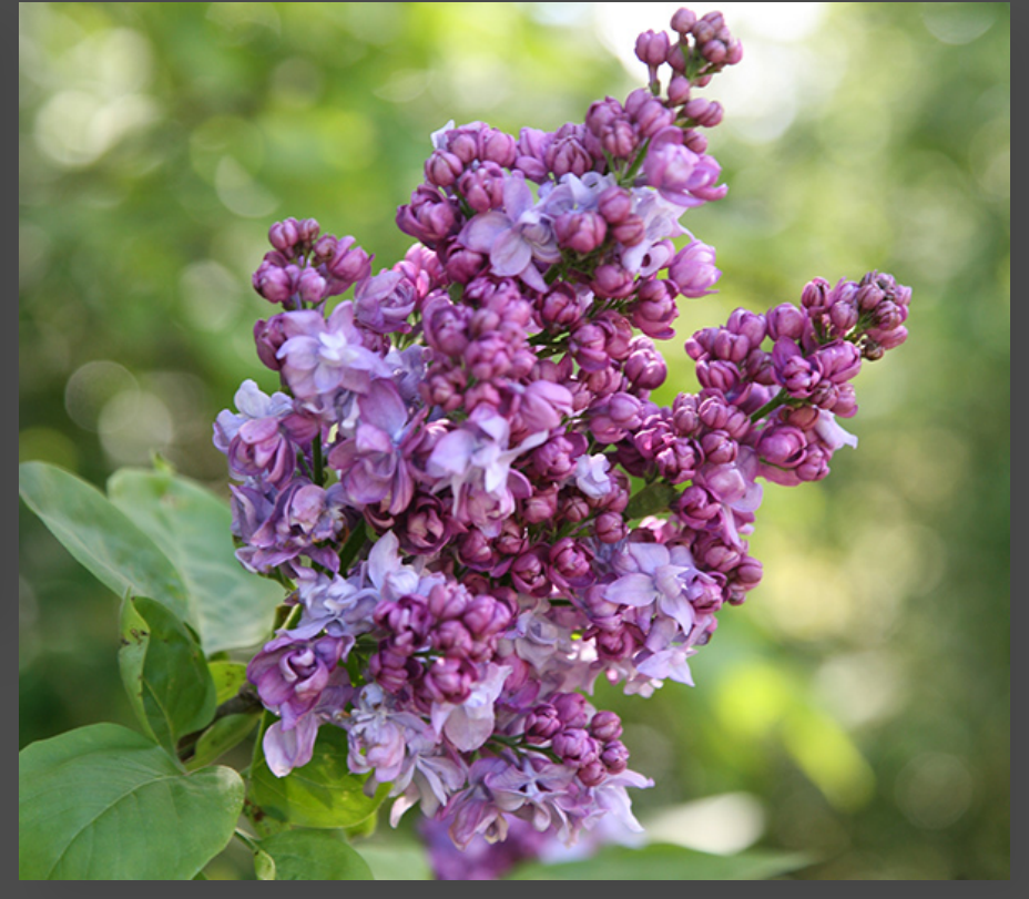
Syringa Charles Jolly

Double magenta highly fragrant flowers Bushy medium sized lilac Flowering: End of May-June