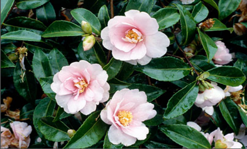
Camellia sasanqua Narumigata one of the few totally happy in full shade