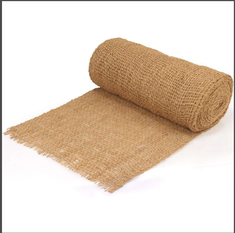
Coir stabilising netting for the front bank before planting