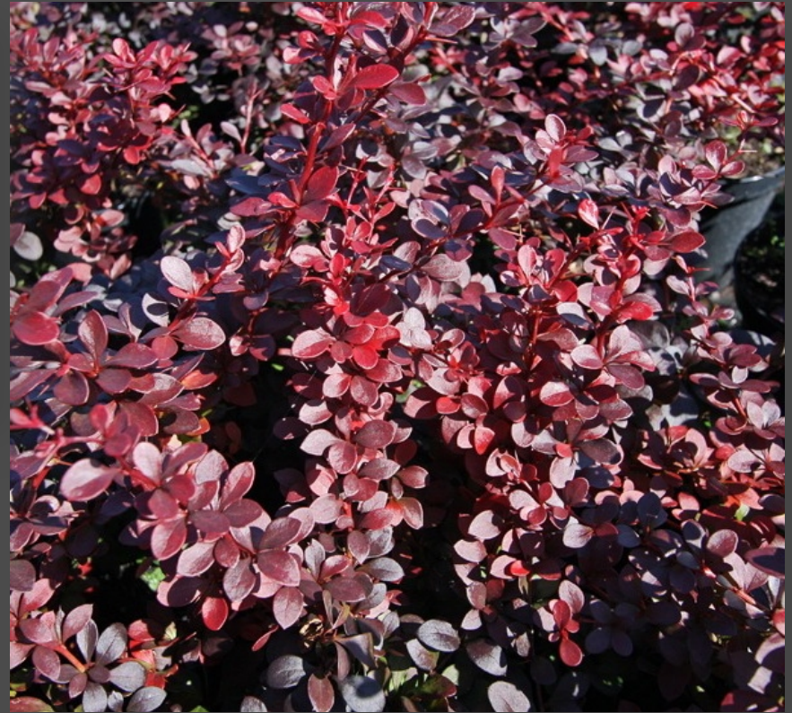
Berberis thunbergii Red Lady

Deep purple red foliage which changes a dramatic orange in Autumn. Fragrant and very bee friendly!