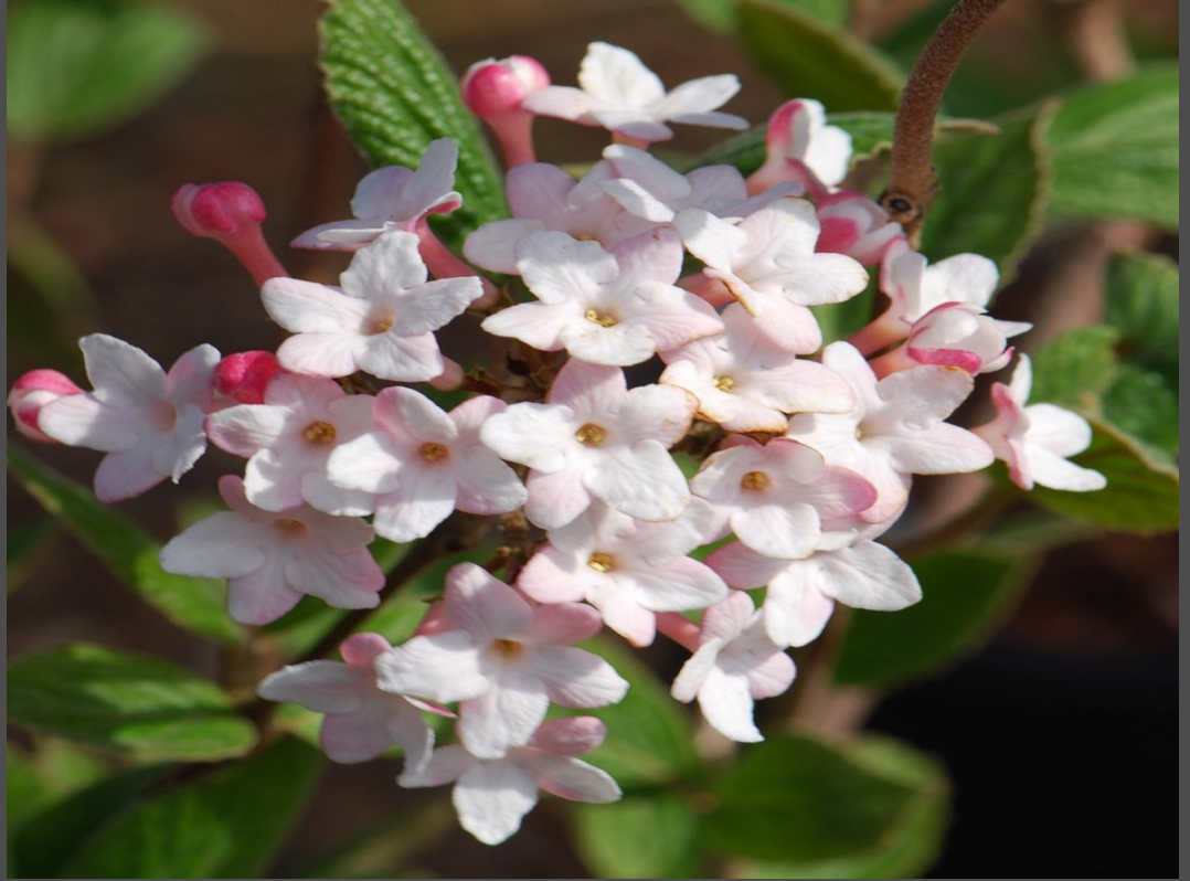
Viburnum x juddii One I have discovered this year with the most fabulous scent in Autumn and into Winter