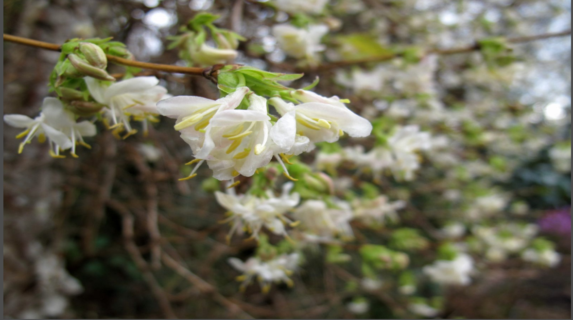
Lonicera purpusii Winter Beauty

Wonderfully fragrant undervalued Winter flowering plant. I propose you get this as close to your front door as possible with the Sweet Box