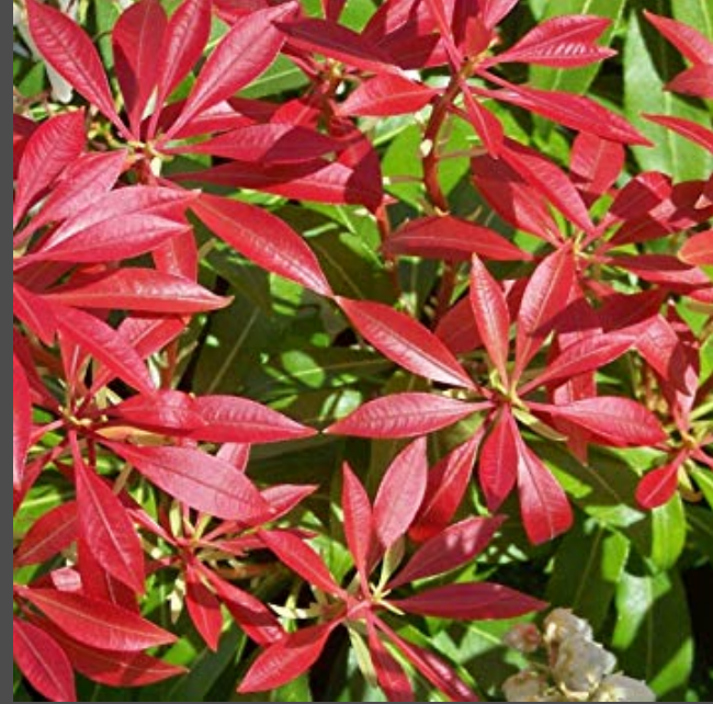
Pieris japonica Mountain Fire

A popular Victorian plant offering up colour in February and March and if it survives the frost, provides a further display in Summer. Slow growing and prefers a partly shady spot so I think there's a space for it here