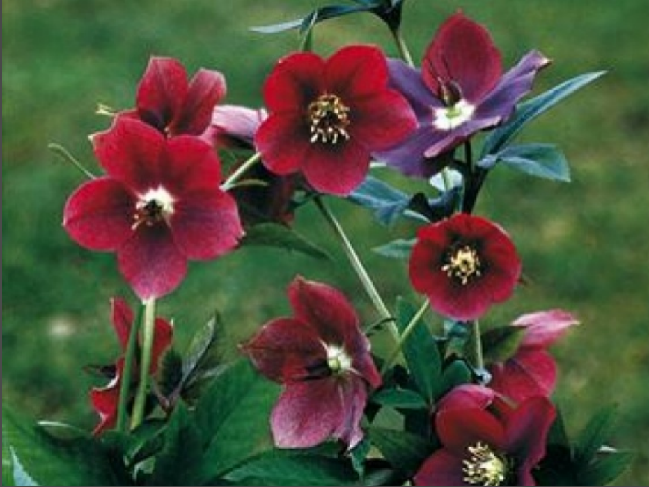
Helleborus Red Lady

Strictly speaking this is a short-lived perennial but The Lenten rose gives colour from January to the end of March