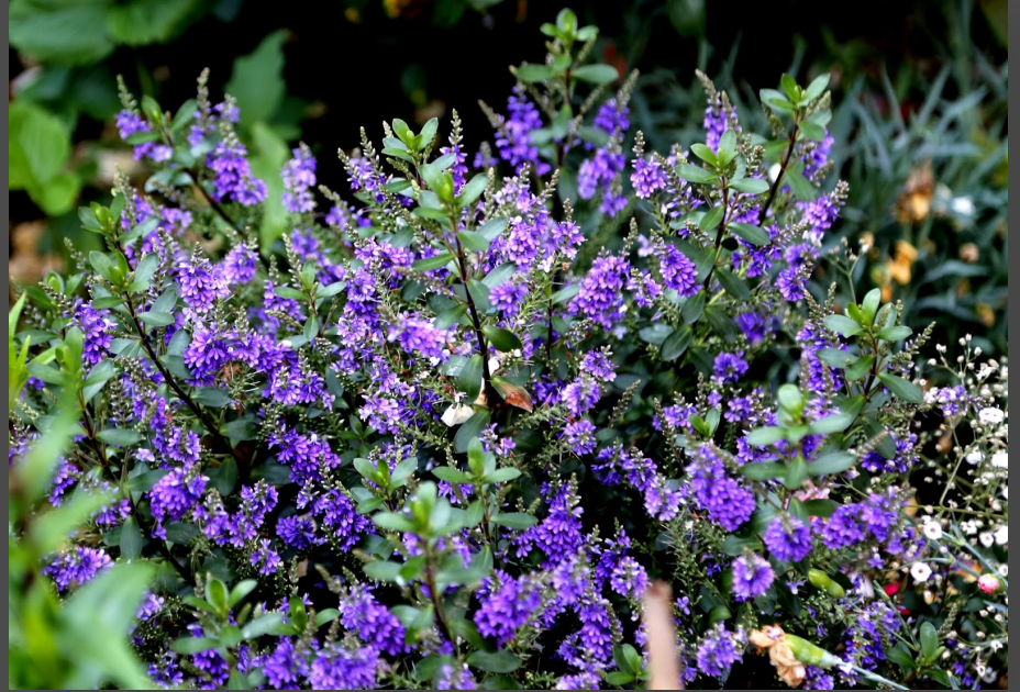
Hebe “Purple Pixie”