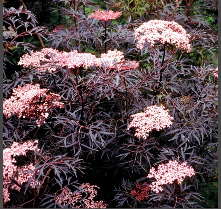
Sambuca nigra 'Black Lace'

The black elderflower is an excellent counterpoint for most perennials as its colour and habit give style and structure to the less formal shrubs