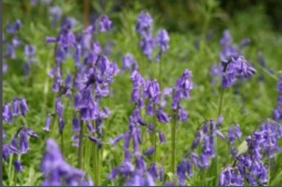
Native Bluebells ®