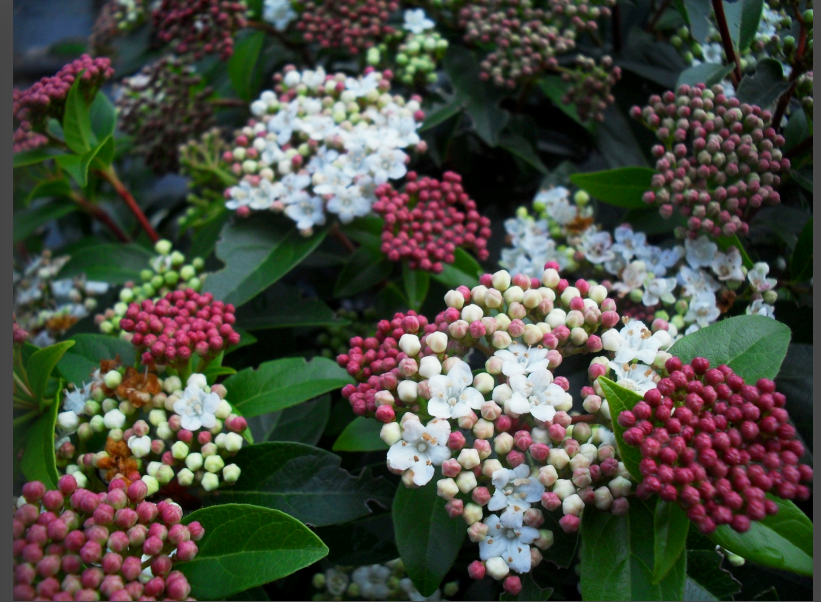
Viburnum tinus 'French white' – reliable evergreen, scented, flowers Feb-March.