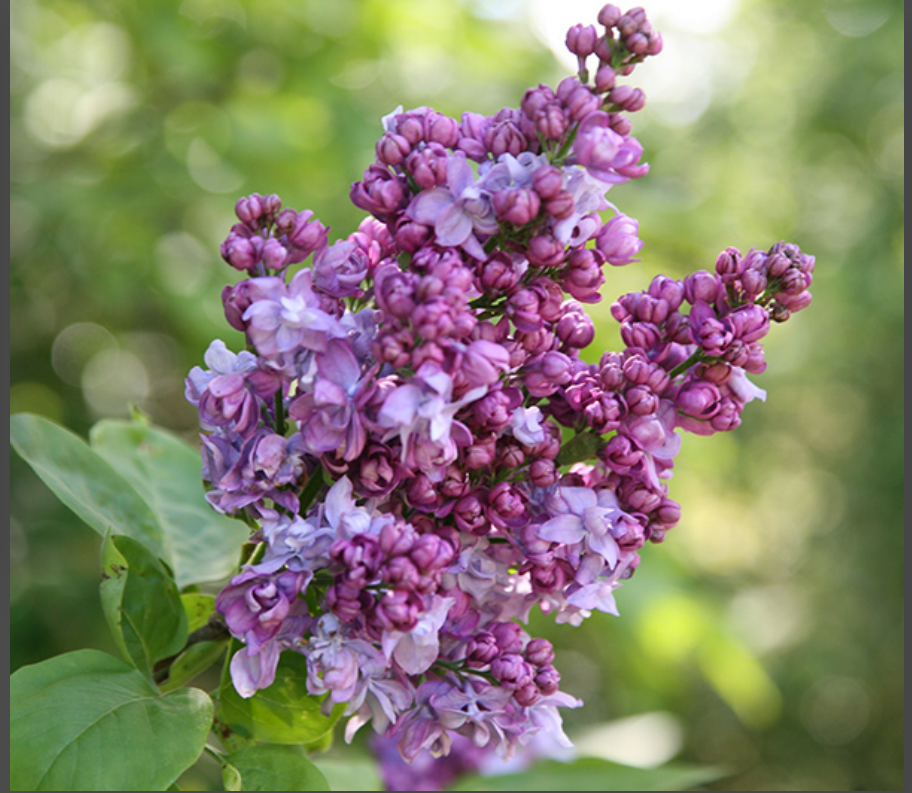
Syringa Charles Jolly