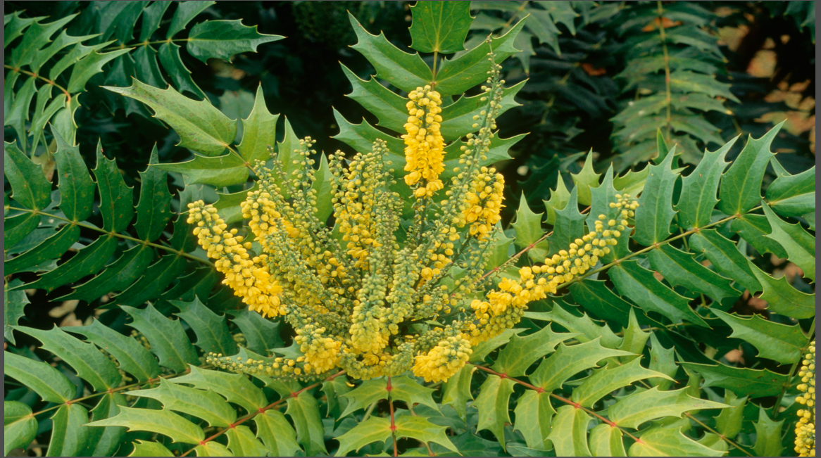
Mahonia x media 'CHARITY' ®

Good show in late Winter. Extremely hardy and I like the leaf structure